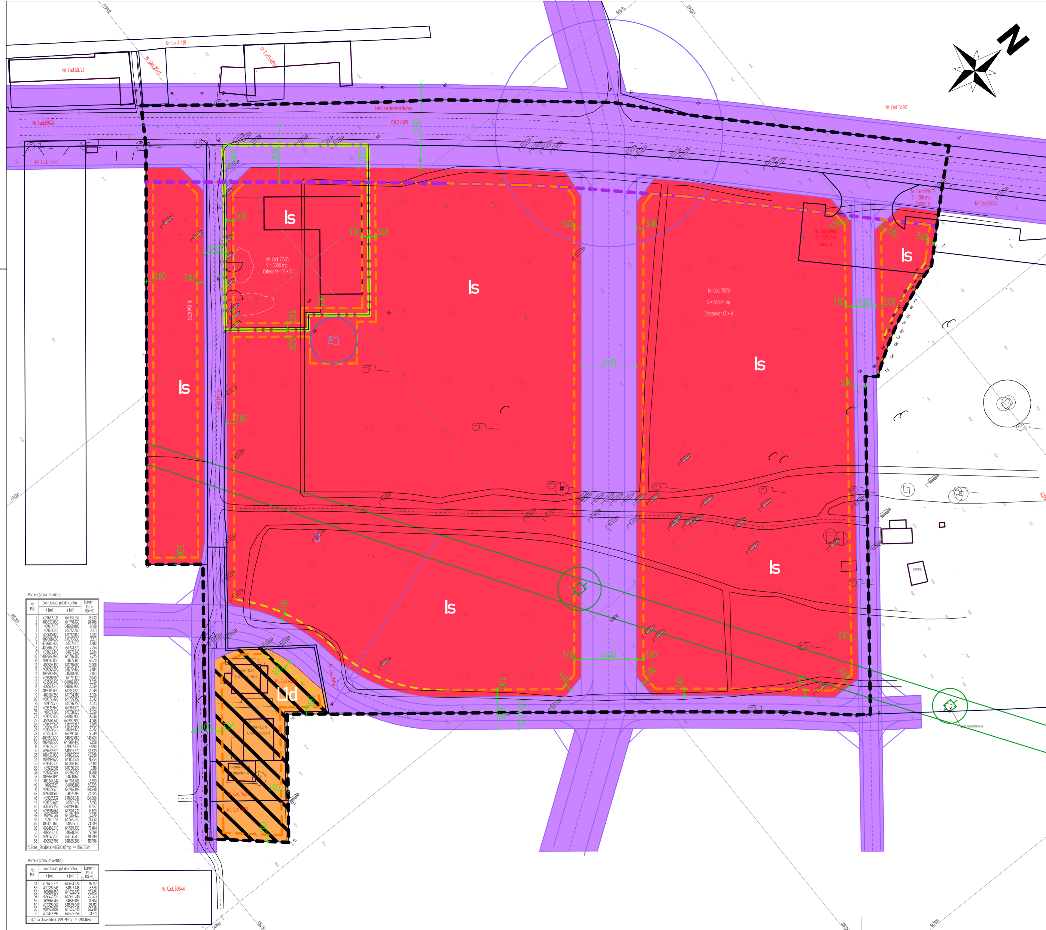
Parcela (Zona Studiată)